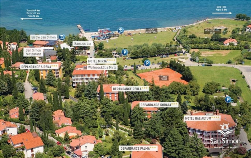
San Simon Resort Izola