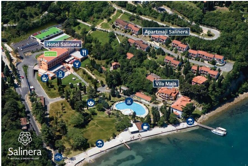
Salinera Resort Strunjan